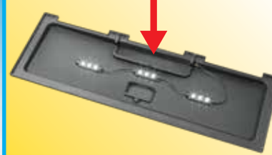
Remove insert from back of light hood