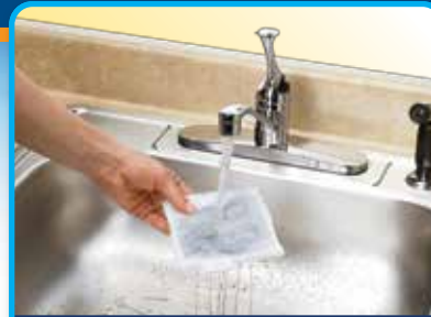
Rinse filter cartridge before use