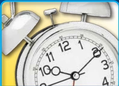
Wait 24 hours before adding fish