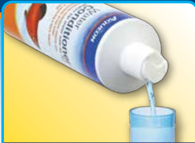
Add Water Conditioner as directed