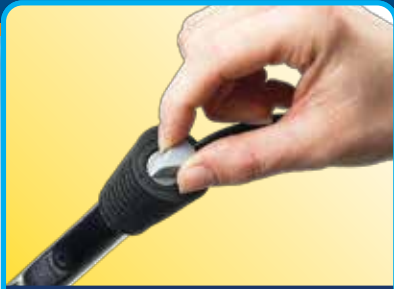
Adjust heater temperature