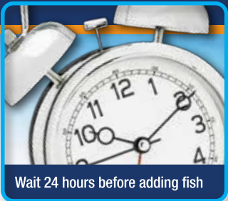
Wait 24 hours before adding fish