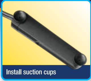
Install suction cups