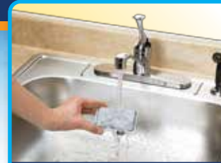
Rinse filter cartridge before use