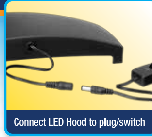
Connect LED Hood to plug/switch