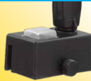
Locate screw on back of LED light