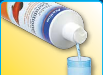
Add Water Conditioner as directed