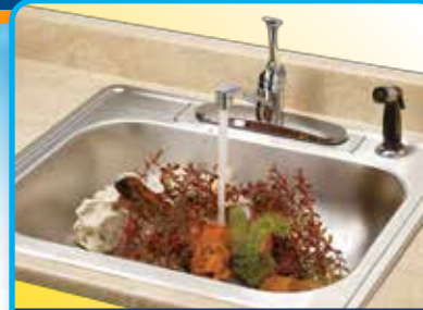
Rinse plants and décor items