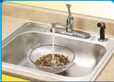
Rinse gravel in collander