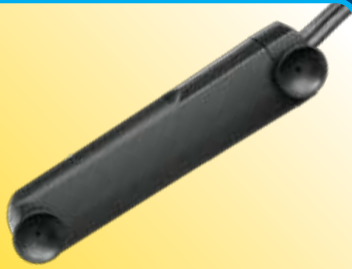
Install suction cups