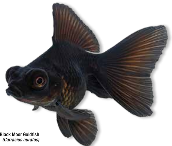
Black Moor Goldfish ( Carrasius auratus )