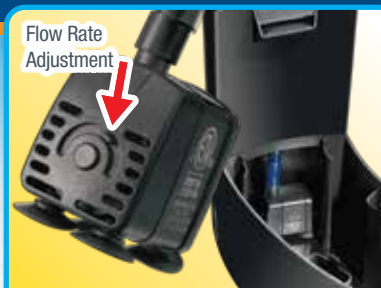
Adjust flow rate of pump as needed