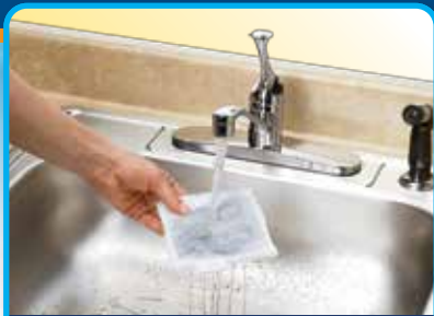
Rinse filter cartridge before use