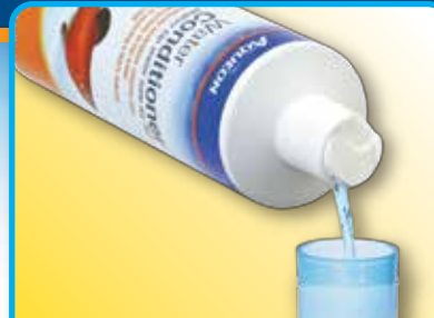
Add Water Conditioner to filter chamber as directed