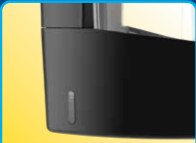
Fill to "Max" level on indicator