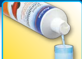
Add Water Conditioner as directed