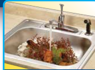
Rinse plants and décor items