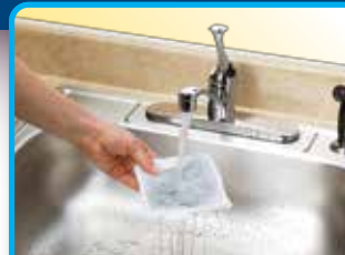
Rinse filter cartridge before use