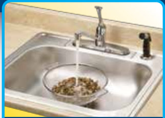
Rinse gravel in colander