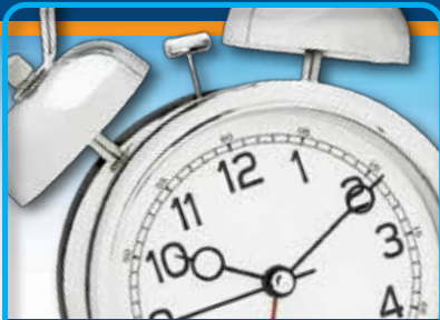
Wait 24 hours before adding fish