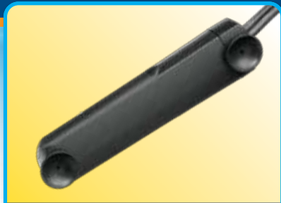
Install suction cups