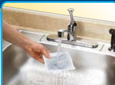
Rinse filter cartridge before use