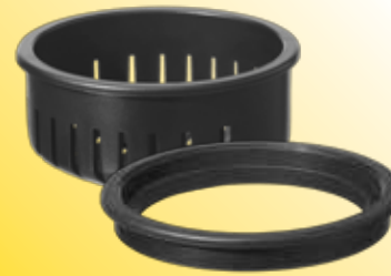
Use cup for included plant, and ring for live plant