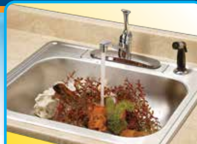
Rinse plants and décor items