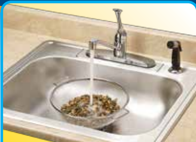
Rinse gravel in collander