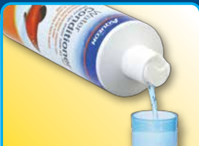
Add Water Conditioner as directed