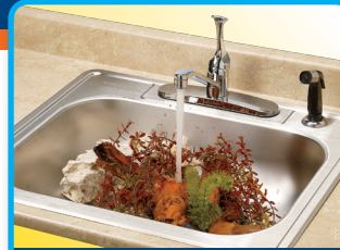
Rinse plants and décor items