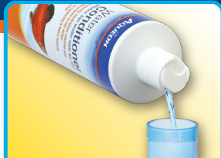
Add Water Conditioner as directed