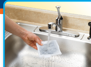
Rinse filter cartridge before use