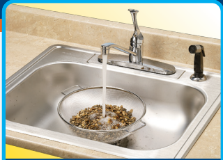
Rinse gravel in colander