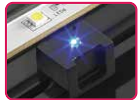
Moon Glow Accent Light